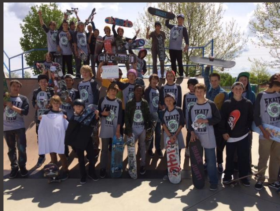
Take Pride & Ride participants

In 2005, DFI merged with the community agency, Parents and Youth Against Substance Abuse (PAYADA), which had been providing substance abuse prevention education in the Treasure Valley since 1982. The joining of these two organizations allowed DFI to extend its reach to include families and youth in the community with one single message: prevention matters.